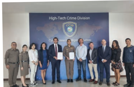
Attendees during the MOU signing between Destiny Rescue and the Thai government

Collaboration has already begun. Destiny Rescue's Global OSEC Rescue Director led a productive training workshop with Thailand's anti-trafficking division earlier this year. The unit commander was so pleased with the training that he directly requested further support from Destiny Rescue.