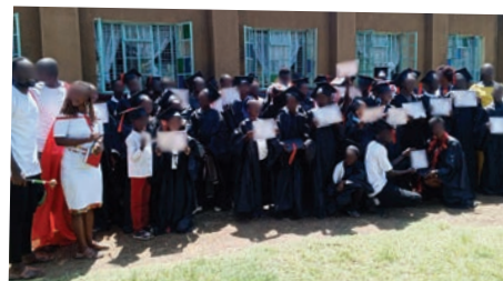
Destiny Rescue staff and rescued children celebrate their graduation from Destiny Rescue programming

In Kenya, survivors of all ages joined with new graduates to celebrate the dawn of their new life of freedom, encouraging and laughing with the kids in a joyful ceremony.