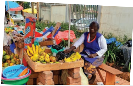
A business owner and guardian of a child in our programming