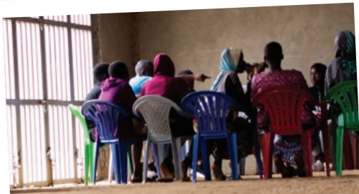
Survivors gather during trauma resilience training

with shepherding a highly traumatized child toward a life of sustainable freedom.