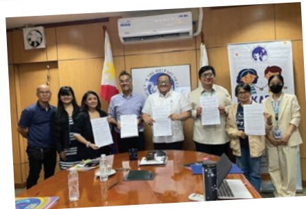
Attendees of the MOU signing

Partnership in Nepal has led to some of our most effective work to date. Officials treat us as a valued asset, working with us to conduct raids, follow up on tips and investigate traffickers, all while their border agents support our border stations.