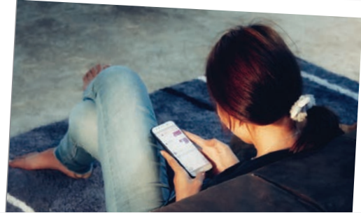
Thailand is currently ranked second in the percentage of children exploited online

We signed new MOUs in Thailand and the Philippines to battle the growing problem of online child exploitation. In Thailand, our team also conducted anti-OSEC training for government agents, police and other non-