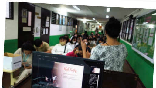
A Destiny Rescue team member in the Philippines leads a Community Education Program

Church members boldly embody Christ's example by seeking out those most at risk where they are and offering freedom. Volunteers within a church often band together to support survivors as well, hosting EMPOWER trauma resilience training and providing a safe place for recovering children to experience love and support.