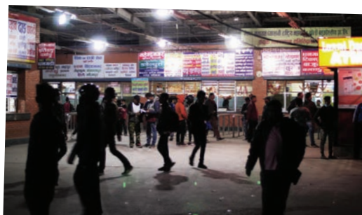
A bus station in Nepal

When the bus finally arrived at the station in the city, Diya and the girls acted fast. As soon as the group was off the bus, they made a break for it, running into the city before their trafficker could catch up with them. Diya and the survivors met up with our rescue agent, who took the girls and hid them in safe houses while our team worked to contact their families.