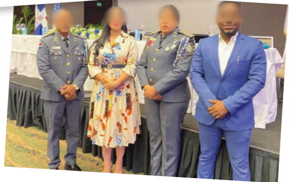
Destiny Rescue Dominican Republic agents work alongside the Dominican Republic National Police