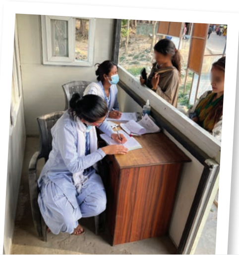
Destiny Rescue agents (blue uniforms) at work in Nepal