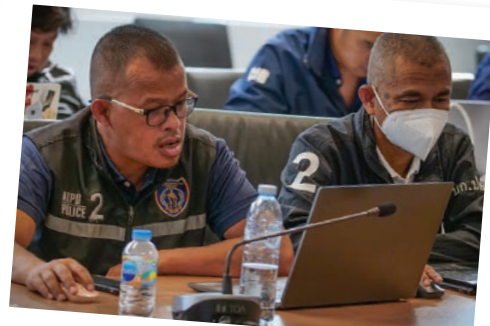
Royal Thai Police officers during a Destiny Rescue OSEC training